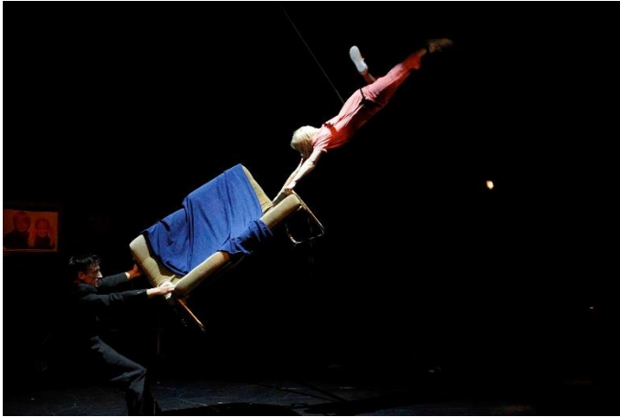
Physical theatre / circus / puppetry

To live in a house is to paint it in memory: layer after layer, the outrageous and the everyday, inhabiting the walls as surely as any ghost. An intricate mesh of slapstick theatre, astonishing circus skills and powerful storytelling, If These Walls Could Talk brings to life the stories inhabiting a single apartment – a place of birth and death, joy and despair, the mundane and the beautiful – as lived in by six generations of tenants. Bristling with humour, physical prowess and deep theatrical ambition, this is an affecting portrayal of life, mortality and the things we leave behind – an astonishing, new work from one of Australia's foremost independent physical theatre companies.