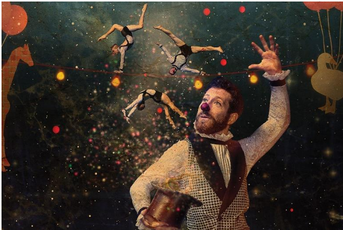
Physical theatre /circus / puppetry

The Circa Carnival comes to town with whimsical tales of creatures from land and sea, who tumble, fly, leap and spin their way through the many wondrous worlds of the animal kingdom. Carnival of the Animals whisks you away on a thrilling circus escapade inspired by Camille Saint-Saens' delightful salute to feathers, fur and fins. Circa's acrobats bring this classical music suite to life for a whole new generation of circus, music and animal lovers. A work of sophisticated and delightful family entertainment, this multimedia reimaging of Carnival of the Animals is at once both contemporary and old world. It's full of wild imagination and explosions of magic and humour that speak to audiences of all ages.